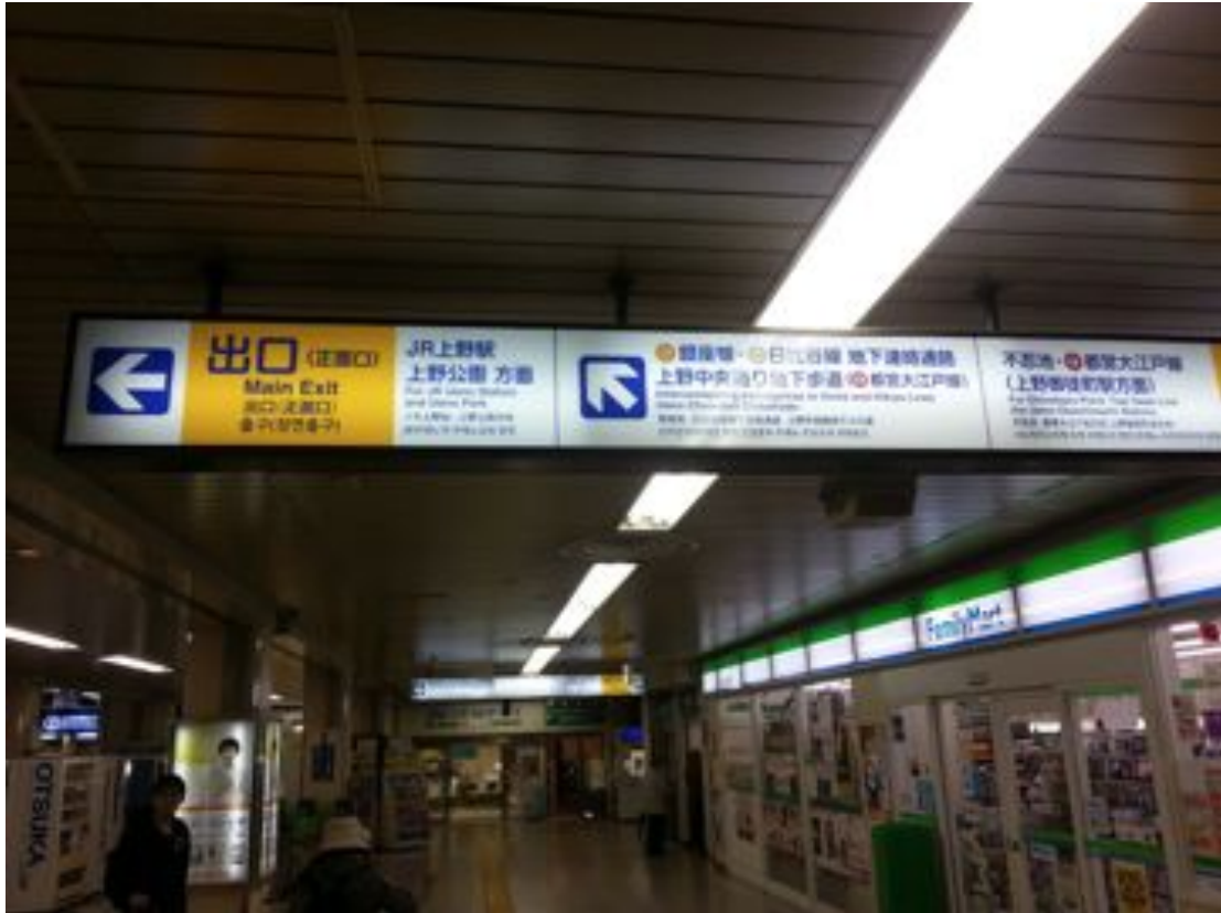
16. Keep following the signs for Hibiya line. You will walk through a long passageway, which will also provide you with your first (and probably only) sight of homeless people in Tokyo. Again, gray circle with H.